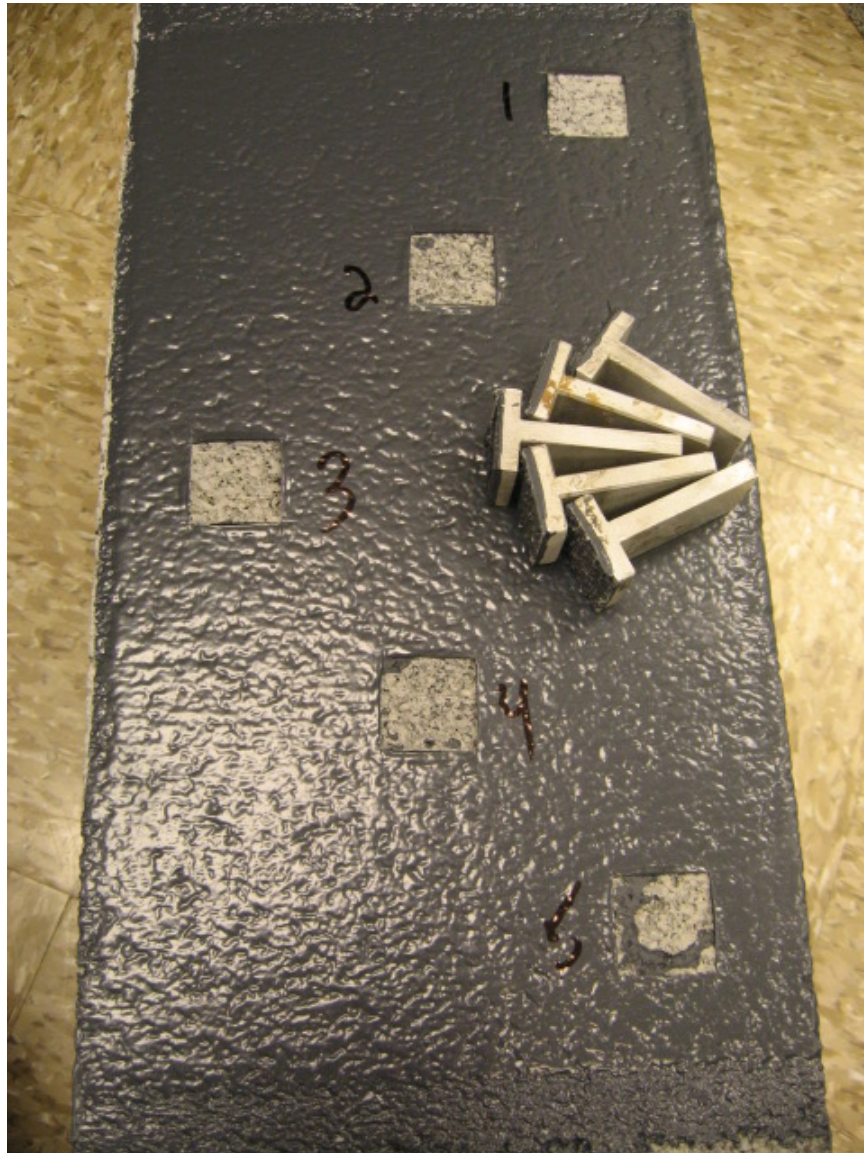
Photo No. 3 Pull-Off Strength - CMU Substrate All Results